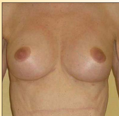
60 year old female six months after 350 cc of fat grafting