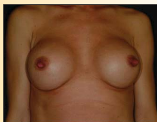
One year after 28 cc fat grafting per side