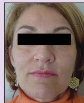
51 year old female ten months after fat injections in the lip, malar region and nasolabial folds

Furthermore, with any surgical procedure there is a learning curve effect. Dr. Del Vecchio believes that one of fat grafting's key barriers is its learning curve. "If you don't get good results you naturally blame the procedure as a whole, not your choice of technique. For example, if you continually over correct, over crowd or over centrifuge, your outcomes will be sub-optimal."