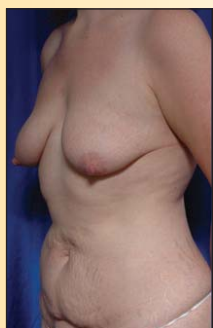
Patient before Tx