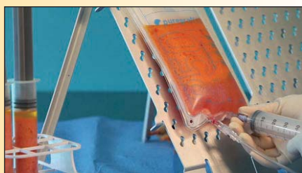
Adding Lactate Ringers to wash the tissue