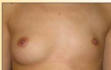
20 year old female who had a benign tumor excision as a child, with agenesis of the left breast