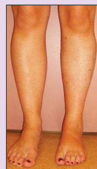
Six months after calf augmentation after three procedures of fat grafting