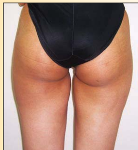
One year after liposuction of the trochanteric area and fat grafting of the atrophic zone