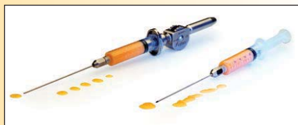
Celbrush precision micro droplets

years without any negative biases or historical issues related to carcinogenesis and it has a solid scientific background of efficacy in other medical applications."