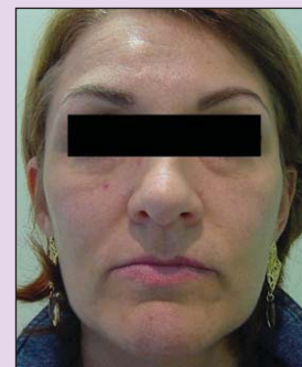
51 year old female before Tx