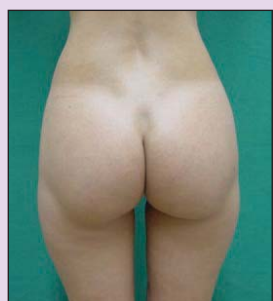
27 year old female six months after laser-assisted liposuction of the hips, buttocks and thighs for treatment of lipodystrophy and fat transfer of the buttocks