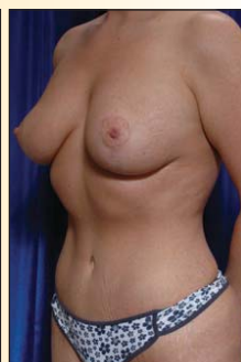
Patient after mastopexy, fat grafting and tummy tuck