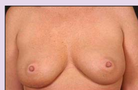
43 year old female with breast cancer who underwent right nipple-sparing mastectomy with sentinel node biopsy, opposite total mastectomy and tissue expander/ADM reconstruction