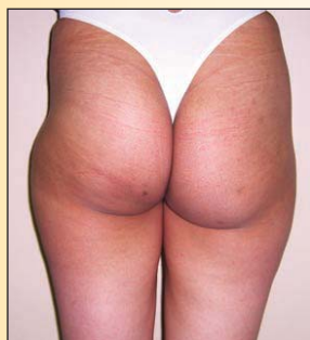
Localized atrophy of the hip after orthopedic surgery