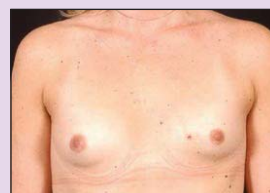
34 year old female with breast cancer who underwent left nipple-sparing mastectomy with sentinel node biopsy, opposite total mastectomy and tissue expander/ADM reconstruction