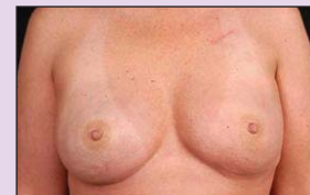
43 year old female after 410 Gummy Bear implants, ADM and fat grafting

“Every advanced plastic surgeon will be harvesting and utilizing fat across the board in its enhanced cellular state. Fat on the reconstruction side will serve as an attractive complement to device reconstruction with acellular dermal grafts. Next-generation breast reconstruction will include minimally invasive incisions, preserving of nipples and enhancing of the soft tissue, leading to beautifully restored breasts. More and more women will opt for full mastectomy over breast conserving (lumpectomy) surgery because the outcome will have improved far beyond today’s standards while avoiding the damaging effects of radiation.”