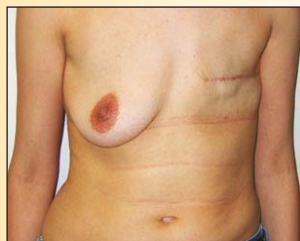
Total modified radical mastectomy