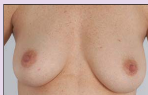
1. 38 year old female day of consultation for bilateral prophylactic mastectomies