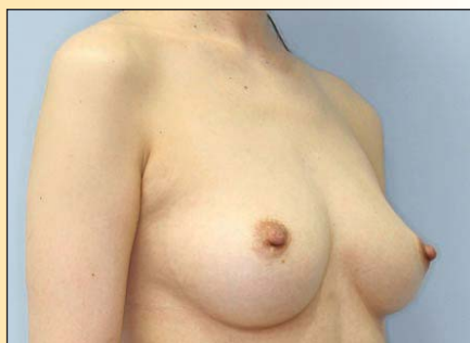
Patient one year after breast implant replacement with autologous fat transfer (Cell-assisted lipotransfer: CAL)