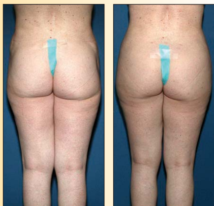
31 year old female after liposuction left her with an unnatural body shape with deficient hips and deep buttock creases