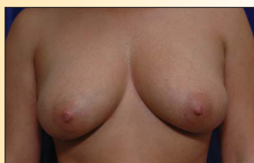
One year after removal of both implants and fat injections