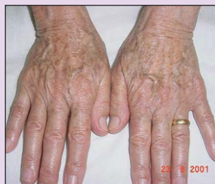
62 year old female with hyperpigmentation and changes in skin texture of the hands before Tx