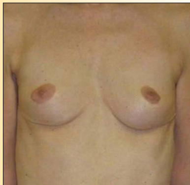
60 year old female with removal of breast implants and deflated breasts