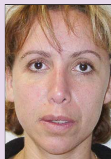
One year after rhinoplasty and two procedures of facial fat grafting