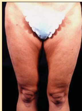
37 year old female following excessive liposuction of the inner-mid thighs and insufficient suction in the upper inner thighs performed elsewhere