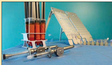
Cytori's PureGraft 250/System and Celbrush