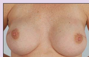
4. 38 year old female two months after exchange of expanders to implants and fat injections