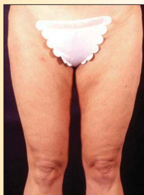
37 year old female after additional suction of the upper inner thigh and autologous fat transfer into the mid inner thighs

"Fat transfer will be widely adopted. Specifically, fat will play a major role in correcting skin compromises (e.g. chronic radiated tissues, hardness and pigmentation changes). More clinical knowledge about fat retention and manipulation in the face will be revealed."