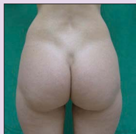
27 year old female before Tx