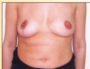
18 months after breast reconstruction with thoracoabdominal advancement flap, latissimus dorsi reshaped by three procedures of fat grafting, contralateral mastopexy