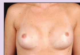
34 year old female after 410 Gummy Bear implants, ADM and fat grafting