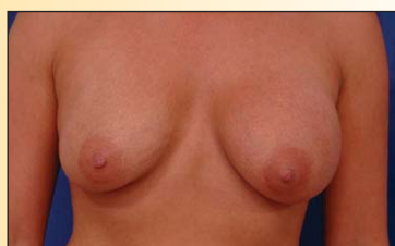
Deflated right saline implant