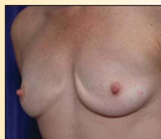
35 year old female with deflated implants prior to fat grafting