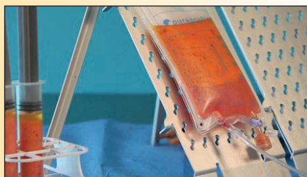
Series of filters separates the graft from tumescent fluid, lipid and debris