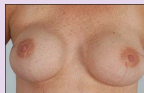
2. 38 year old female three months after bilateral mastectomies and immediate reconstruction with tissue expanders and alloderm