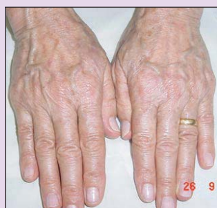
62 year old female one month after Nd:YAG laser and IPL Tx and fat injection in the dorsum of the hand